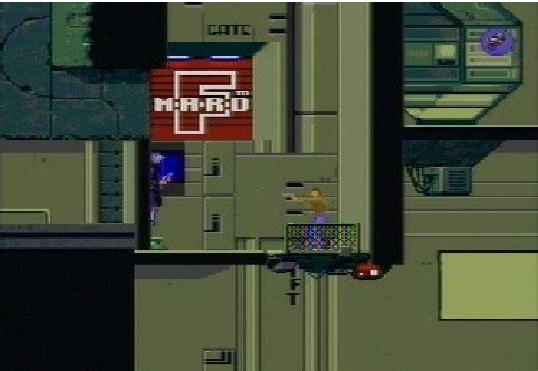
Solution flashback super nintendo. How to go back on super nintendo. Soluce flashback super nintendo. How to open super nintendo. Flashback jeu super nintendo. Flashback super nintendo rom. How to save progress on super mario world super nintendo. Super nintendo flashback console.